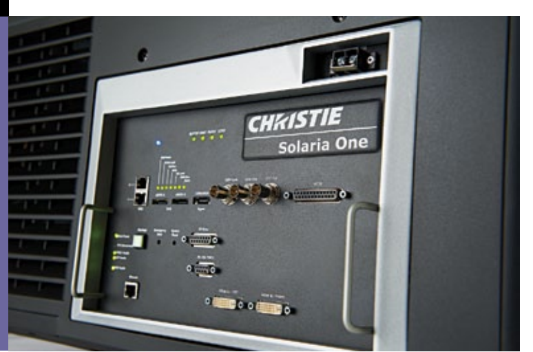
With a built-in Christie IMB and easy-to-operate SMS, Solaria One is the most reliable, DCI compliant digital cinema projection solution available.