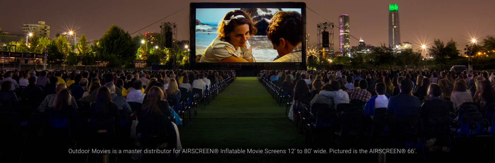
Outdoor Movies is a master distributor for AIRSCREEN® Inflatable Movie Screens 12' to 80' wide. Pictured is the AIRSCREEN® 66'.