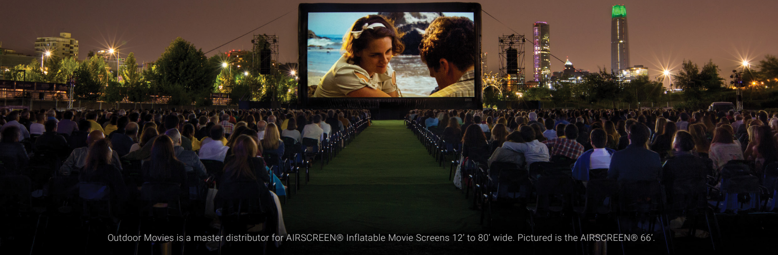
Outdoor Movies is a master distributor for AIRSCREEN® Inflatable Movie Screens 12' to 80' wide. Pictured is the AIRSCREEN® 66'.