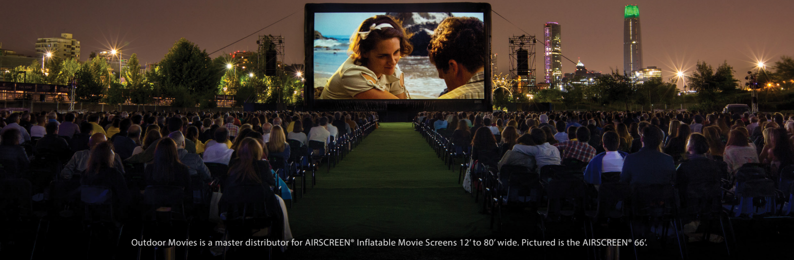
Outdoor Movies is a master distributor for AIRSCREEN® Inflatable Movie Screens 12' to 80' wide. Pictured is the AIRSCREEN® 66'.