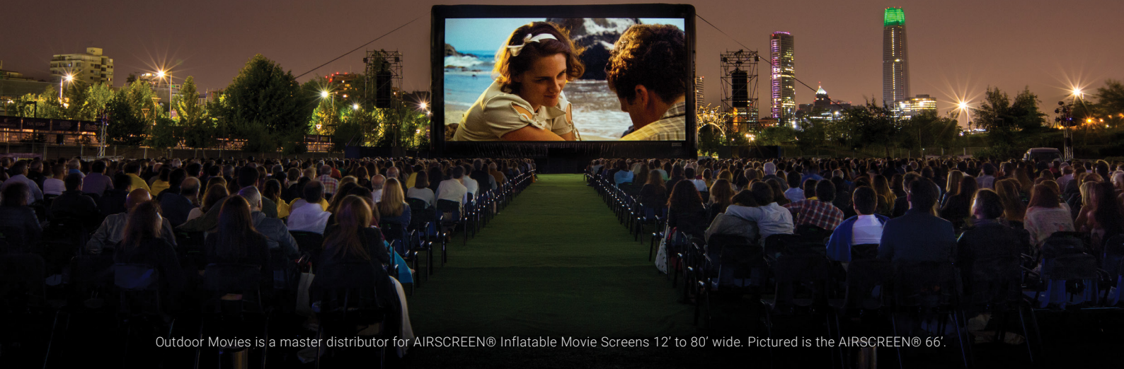
Outdoor Movies is a master distributor for AIRSCREEN® Inflatable Movie Screens 12' to 80' wide. Pictured is the AIRSCREEN® 66'.