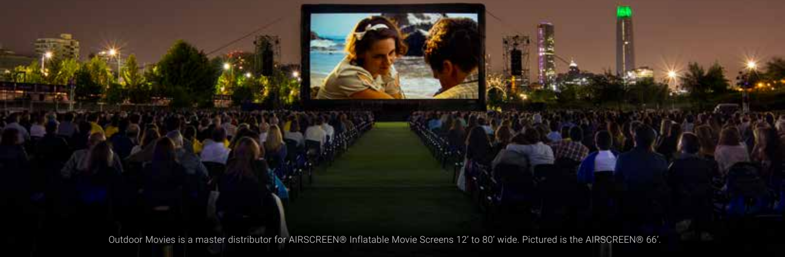
Outdoor Movies is a master distributor for AIRSCREEN® Inflatable Movie Screens 12' to 80' wide. Pictured is the AIRSCREEN® 66'.