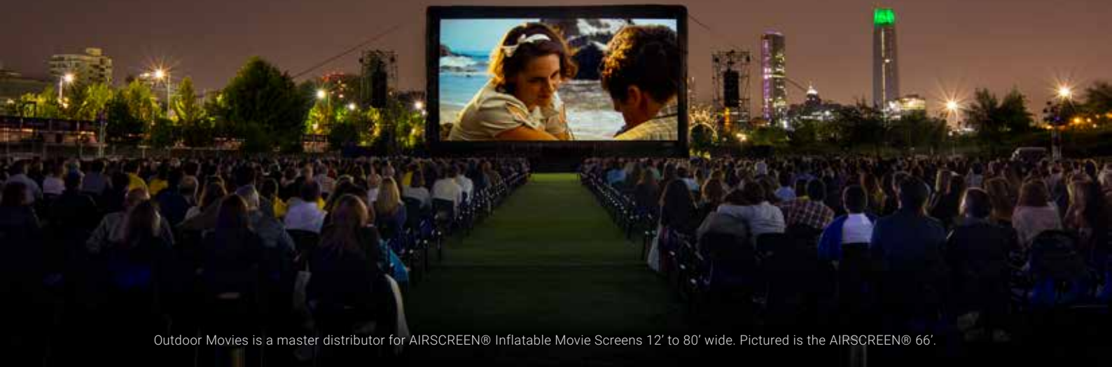
Outdoor Movies is a master distributor for AIRSCREEN® Inflatable Movie Screens 12' to 80' wide. Pictured is the AIRSCREEN® 66'.